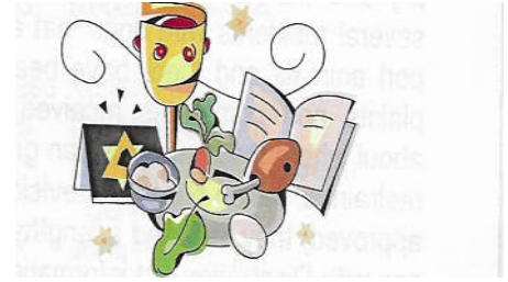
Passover begins at sunset April 19th