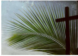
Easter is April 21 st